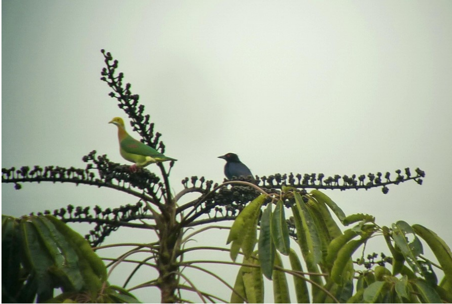
Pink-spotted Fruit Dove (left) and Trumpet Manucode (right).

Pink-spotted Fruit Dove Ptilinopus perlatus [E]- Seen at Varirata and Kiunga.