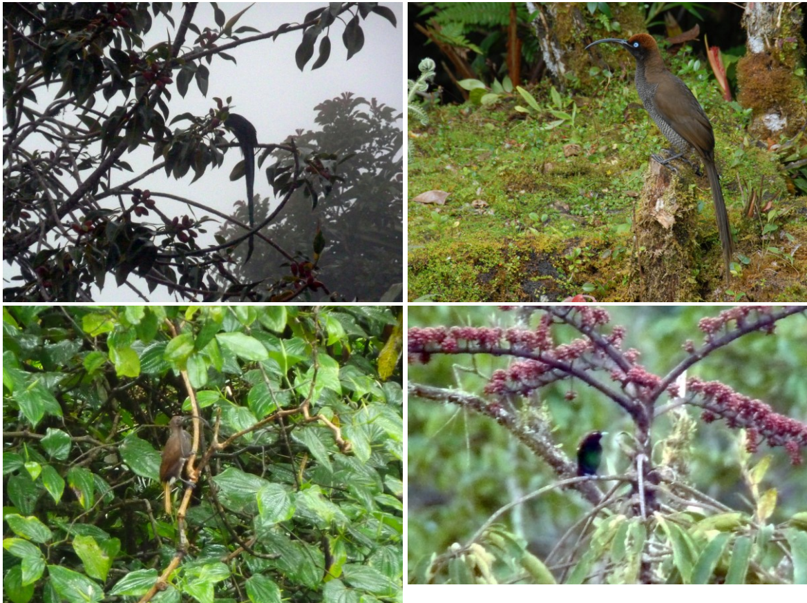
Black Sicklebill (male; top, left); Brown Sicklebill (female; top, right); Black-billed Sicklebill (immature male; bottom, left); Magnificent Bird-of-paradise (male; bottom, right)

Magnificent Bird-of-paradise Diphyllodes magnificus [E] - Two females and scope views of a male at Dablin Creek. The male showed well seen, including the bright blue tail feathers, and occasionally the pineapple-coloured neck feathers were raised as a gesture to nearby ladies.