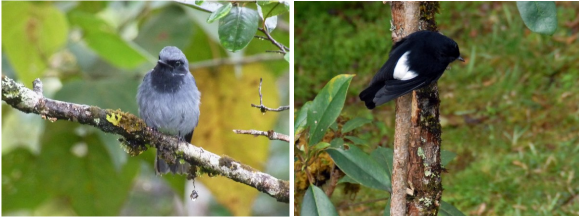
Black-throated Robin (left) and White-winged Robin (right)

White-winged Robin Peneothello sigillata [E] – Seen at Kumul and Ambua.