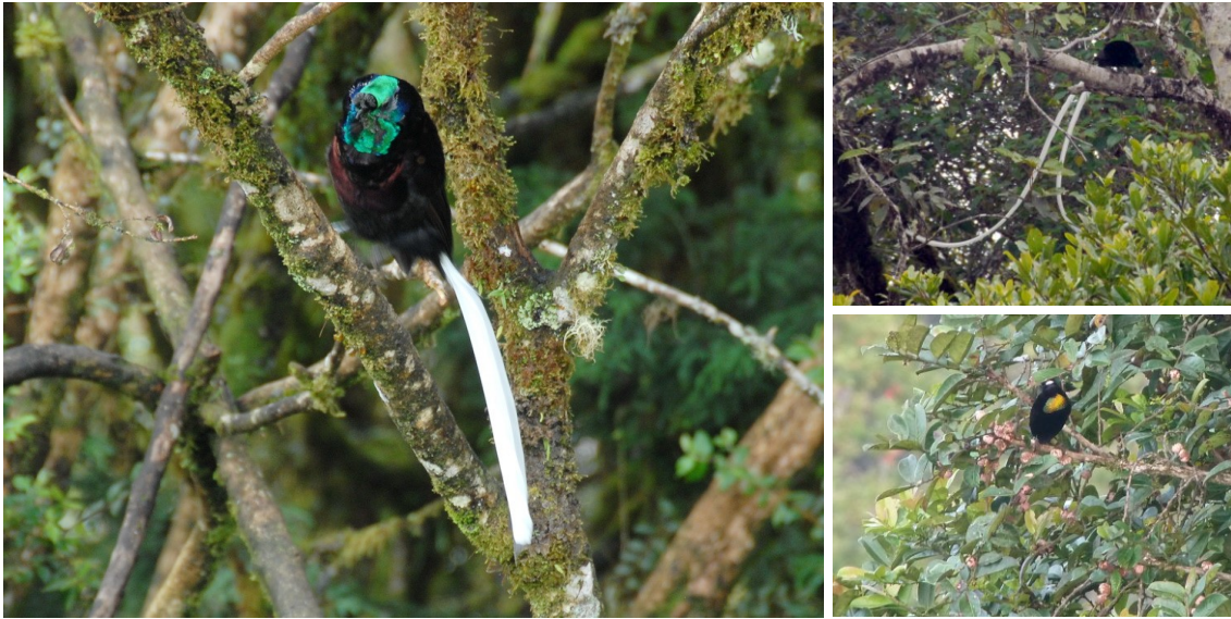
Ribbon-tailed Astrapia: left and top right; Lawes's Parotia: lower right.

Ribbon-tailed Astrapia Astrapia mayeri [E] – Discovered in 1939, and common in a limited area in the mountains of PNG. In flight, the streamers, which are 4 to 5 times the body length, resemble long white ribbons, giving the bird a unique appearance. Seen almost daily in Kumul and Tari.