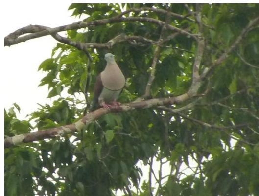
Knob-billed Fruit Dove (top, left); Southern Crowned Pigeon (top, right); Yellowish Imperial Pigeon (bottom, left); Collared Imperial Pigeon (lower right).